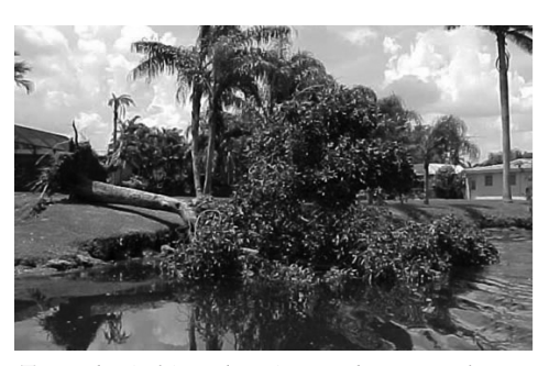
Trees planted too close to canals may end up as obstructions.

We live in a low, flat place and depend on our interconnected drainage system to remove excess water after storm events, including tropical storms and hurricanes. Vegetation and structures along a canal right of way may end up in the canal and cause blockages around downstream water control structures. In turn, these obstructions will prevent water from properly draining and could result in flooding that endangers the safety of residents in the immediate area and many miles away.